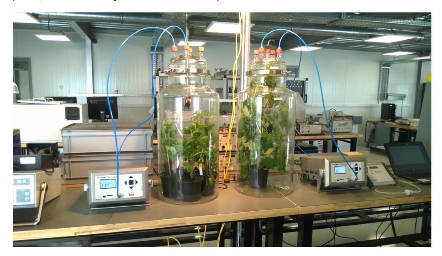
Figure 1: Test setup of both different tomato varieties.

The results show indeed differences in production rates which are expressed in nl/g/hr (nanoliter ethene per gram green parts per hour). The "Epi" modified tomato plants produces about 2.5 times more ethylene then the standard cultivar "Moneymaker". A repetition of this test with other plants, results in exactly the same results and production rates.